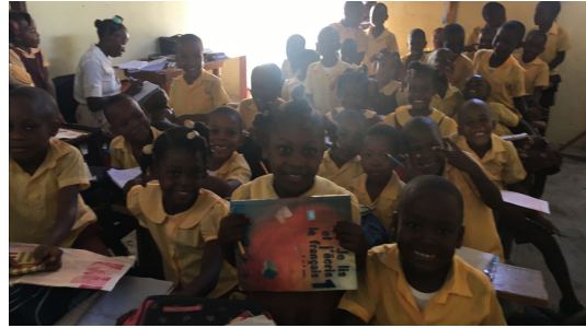
Primary 3 and 4