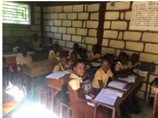
Secondary 1 and 2