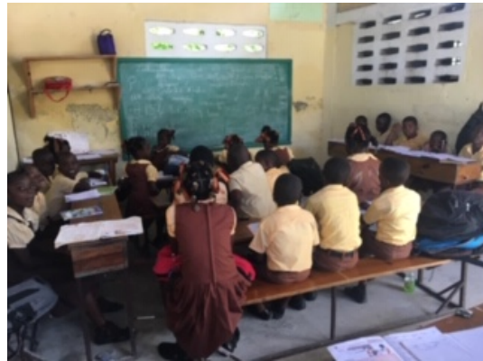
Primary 5 and 6