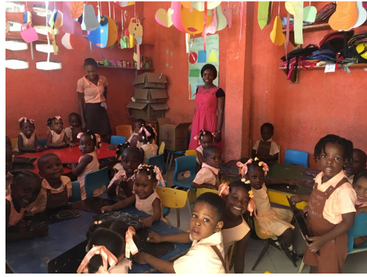
Primary 1 and 2